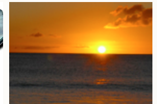
The future begins tomorrow -- today is yours!