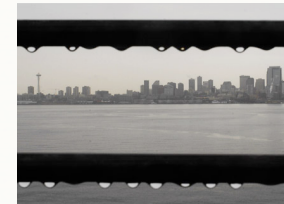
It looks bleak, sure...

Some challenges come from the world around us, but some come from within. Our bodies, our minds, our emotions, these are wonderful and marvelous machines! But like any machine, they occasionally break down or, at the very least, just need a bit of lubrication. It's no coincidence that many auto mechanics have useful and informative pamphlets in their lobbies. Check them out, every three months or 3,000 miles (whichever comes first)!