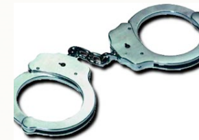
We all have something we'd like to get rid of.

Nearly everyone could do with a little assistance in their personal development endeavors. For those of you who choose to confront those challenges, we salute you! You have chosen to turn face forward into a maelstrom of fun, excitement and insurmountable opportunities. Choose a Self-Help Pamphlet to help you pick a direction and take those first few, supremely important steps into a new tomorrow. Charge!