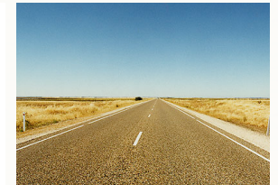
Full speed ahead!