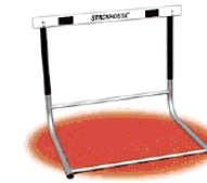
You CAN deal with it!

We all trip over little obstacles from time to time. And some of them aren't so little. A Life's Challenge Pamphlet might just be the thing to help you over that occasional hurdle on your personal jogging track. Learn how to jump it, go around it or just plow straight through to a fabulous future: Read a pamphlet today!