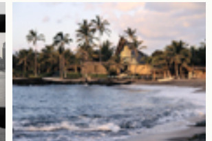
...but take a pamphlet and see what happens!